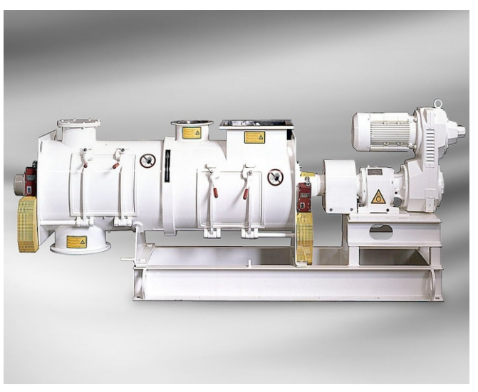
KM DW 600